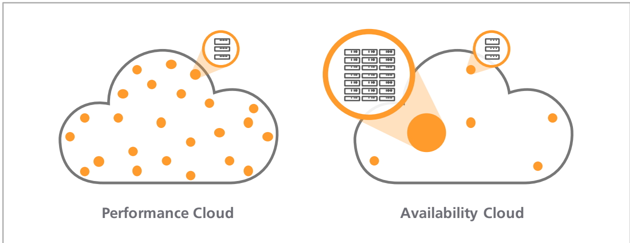
Figure 1: Fast DNS combines multiple DNS clouds with different architectures to offer an optimal combination of performance, availability and resiliency against DDoS attack.